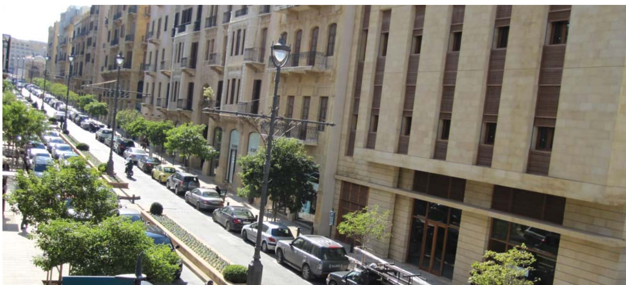
View on Foch Street

A 251 SQM apartment, benefiting from a sea view and exclusive views on the adjacent belvedere, overlooking the ancient Tell and the garden with historic ruins