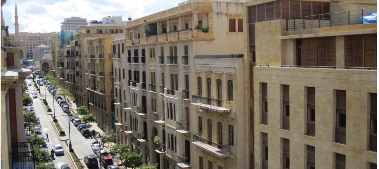
View on Foch Street

A 251 SQM apartment, benefiting from a sea view and exclusive views on the adjacent belvedere, overlooking the ancient Tell and the garden with historic ruins