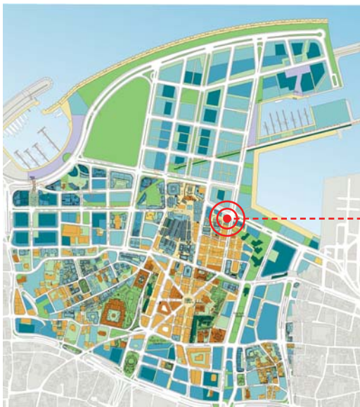
In the Heart of the City