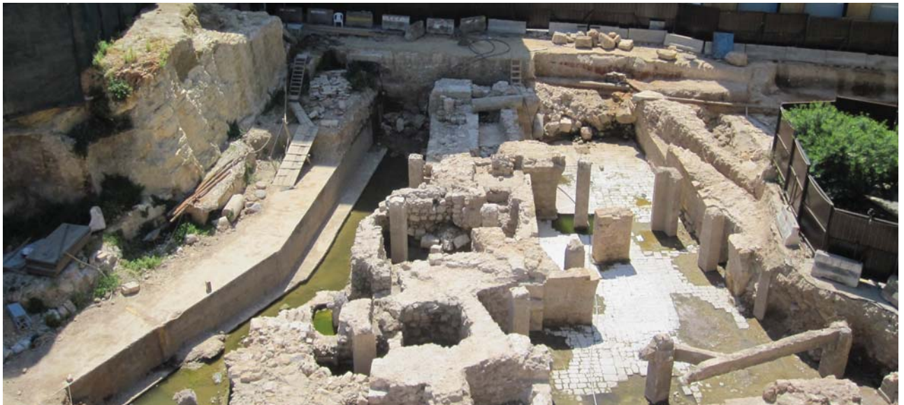
Direct Access from the Historical Tell Area

A 347 SQM apartment, benefiting from a sea view and exclusive views on the adjacent belvedere, overlooking the ancient Tell and the garden with historic ruins