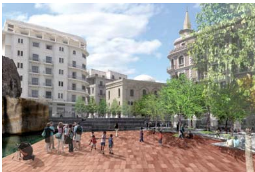
Archeological Tell Plaza